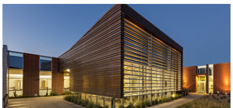
Center for Entrepreneurial Innovation