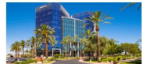
Three Gateway Offices