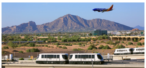
Phoenix Sky Harbor International Airport